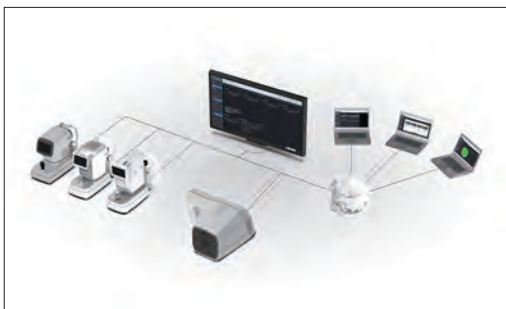
Network in Huvitz Integrated Image Server(HIIS-1)